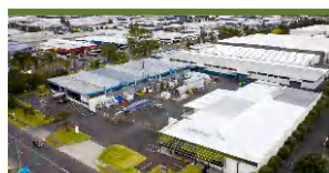
12 Allens Road, East Tamaki