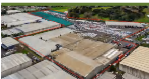
8-14 Mt Richmond Drive, Mt Wellington