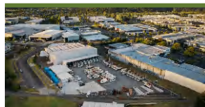
15 Unity Drive, Albany