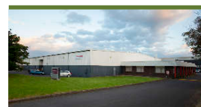
5 Allens Road, East Tamaki