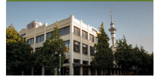
39 Market Place, Viaduct Harbour