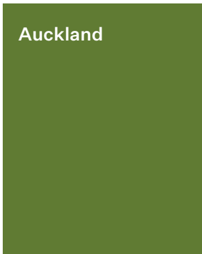
19 Nesdale Avenue, Wiri