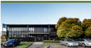
17 Mayo Road, Wiri