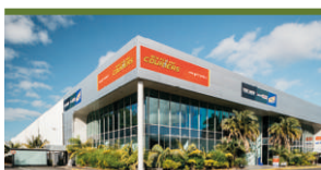
1 Rothwell Avenue, Albany