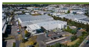
211 Albany Highway, Albany