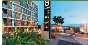
8 Nugent Street, Grafton