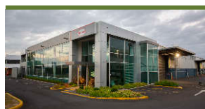
106 Springs Road, East Tamaki