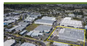
9 Ride Way, Albany