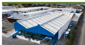
32 Bell Avenue, Mt Wellington