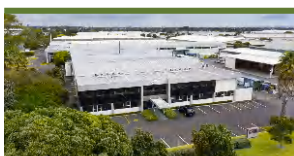
2 Allens Road, East Tamaki