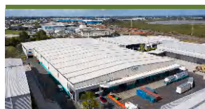
12-16 Bell Avenue, Mt Wellington