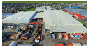
240 Puhinui Road, Manukau