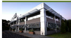
80-120 Favona Road, Mangere