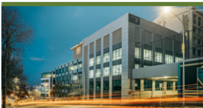
82 Wyndham Street