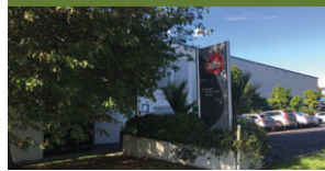
1-3 Unity Drive, Albany