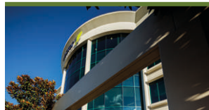
101 Carlton Gore Road, Newmarket