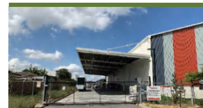
244 Puhinui Road, Manukau