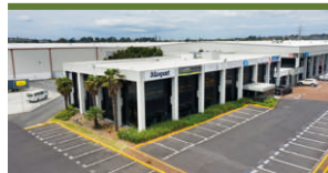
320 Ti Rakau Drive, East Tamaki