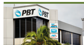
18-20 Bell Avenue, Mt Wellington