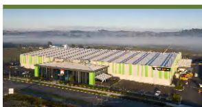
Highgate Parkway, Silverdale