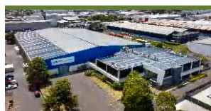
4 Henderson Place, Onehunga