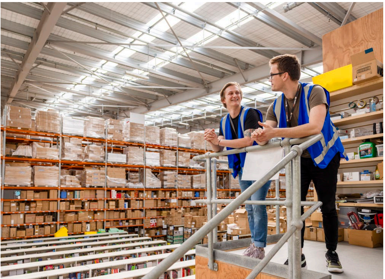
24 – 28 Highgate Parkway, Silverdale, Auckland